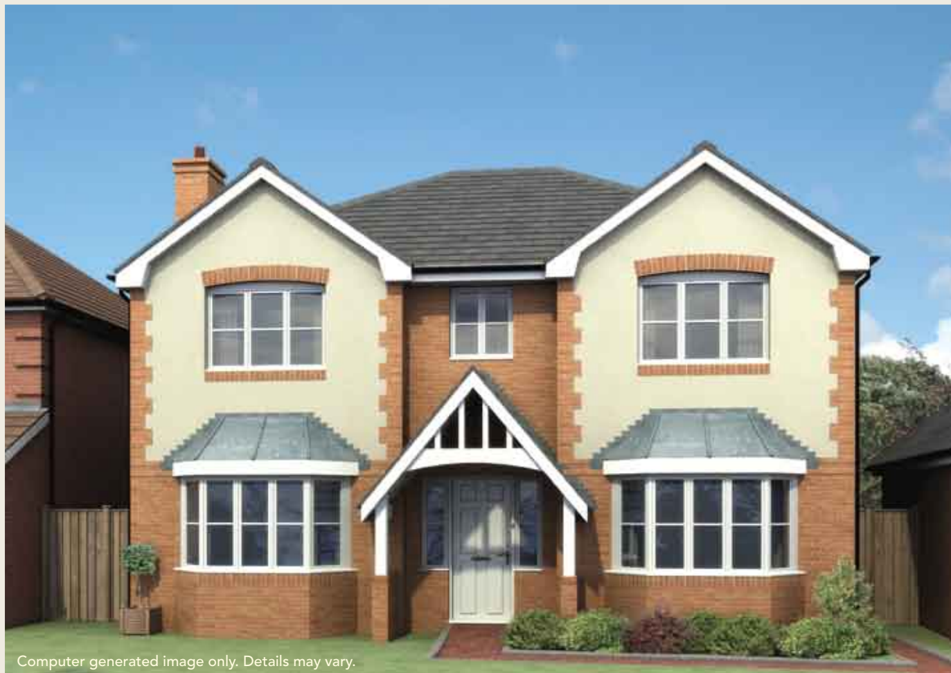
Computer generated image only. Details may vary.

Striking, double fronted property with feature gabled porch