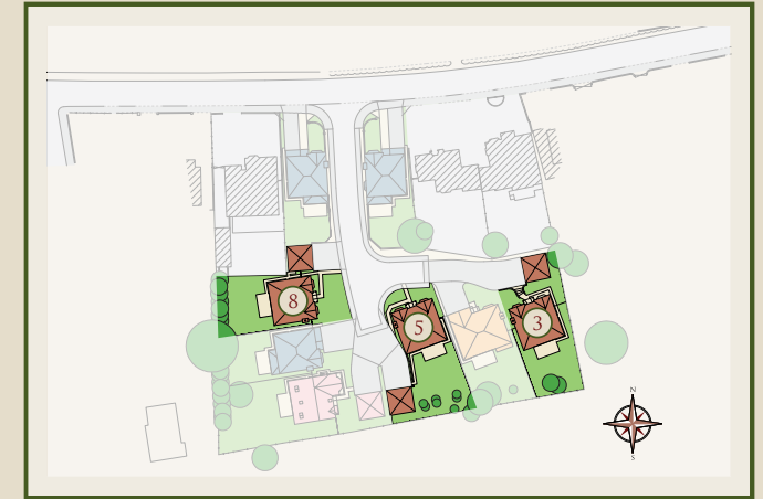
Site plan not to scale