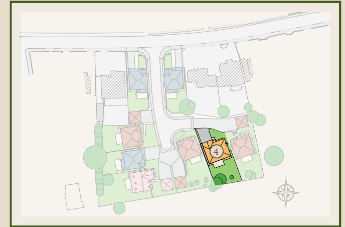
Site plan not to scale