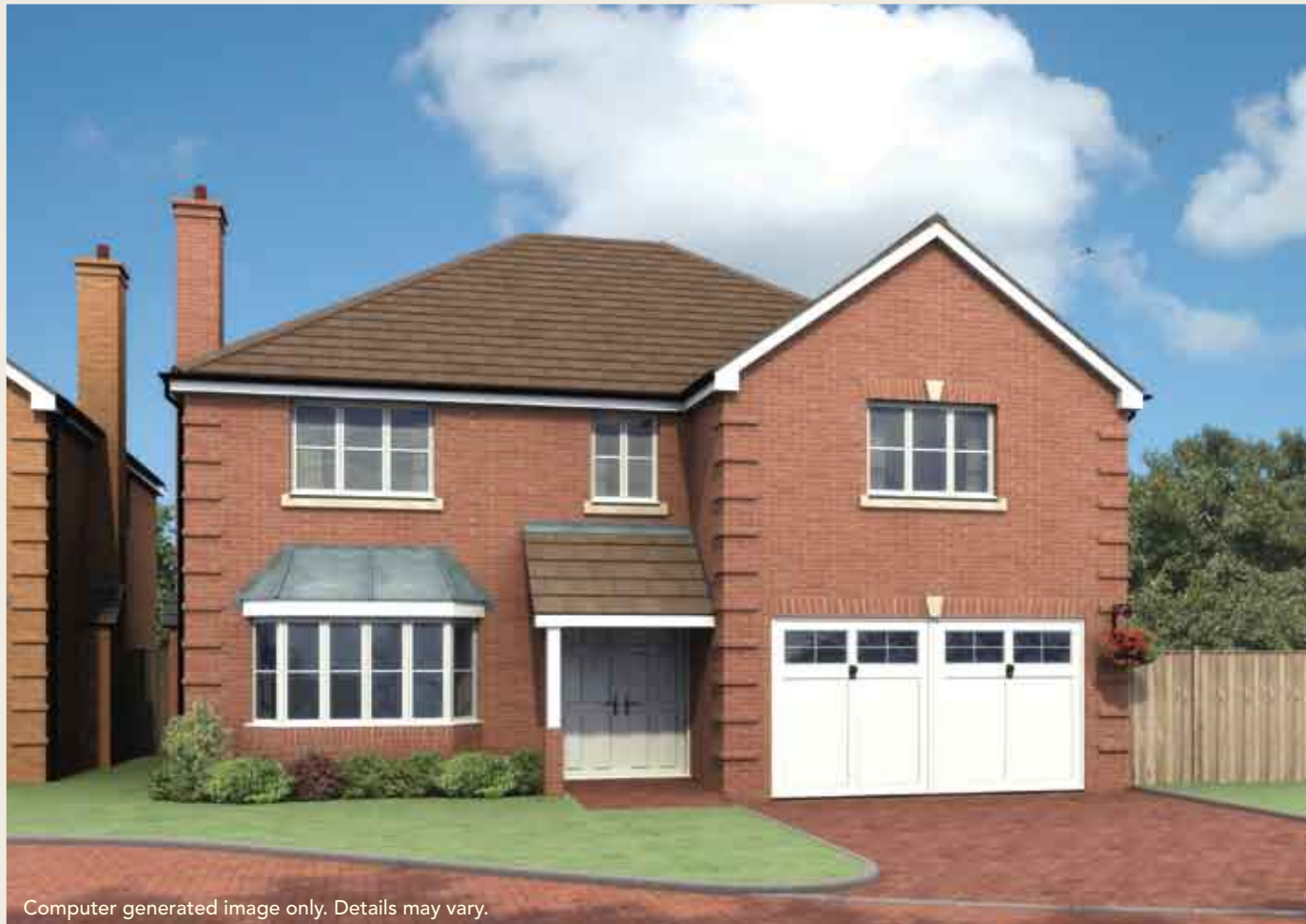
Computer generated image only. Details may vary.

Executive 5 bedroom home with large integrated double garage