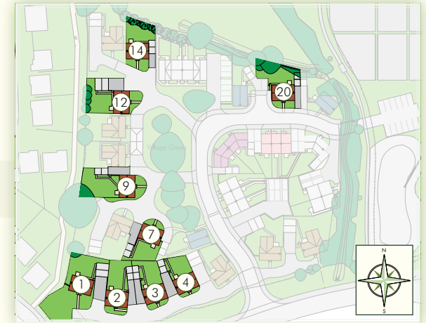
Site plan not to scale.

(Plots 1, 2, 3, 4, 7, 9, 12, 14 & 20) 4 bedroom house