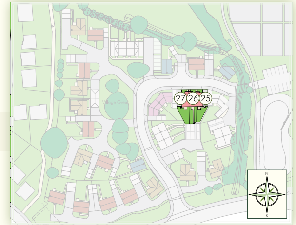
Site plan not to scale.